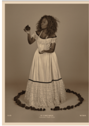
Image 8 TNT 21 Heather Agyepong Caucasian Chalk Circle , 2020