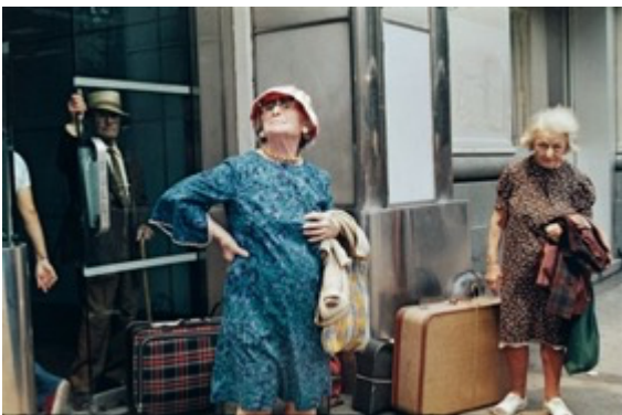
Image 1 Helen Levitt New York, 1973