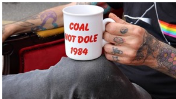
Image 4 Helen Cammock Still from Concrete Feathers and Porcelain Tacks , 2021