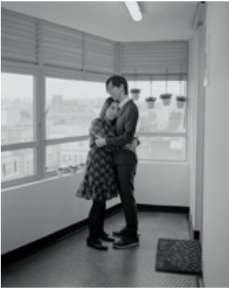
Image 11 TNT21 Wing Ka Ho Jimmi From So Close and Yet So Far Away , 2021 © Wing Ka Ho Jimmi Courtesy of the artist