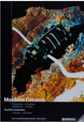
Image 13 Light Years: The Photographers' Gallery at 50 Exhibition Poster Machine Dreams , held at The Photographers' Gallery, 1989