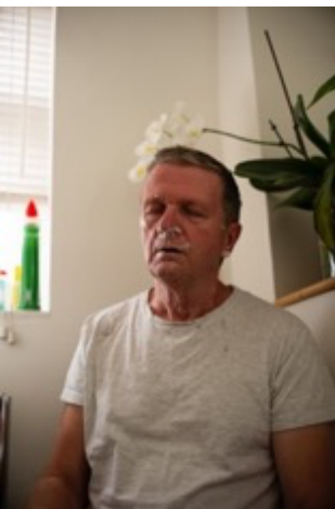
Image 9 TNT21 Ollie Gapper From the series Ever Forward, Back , 2021