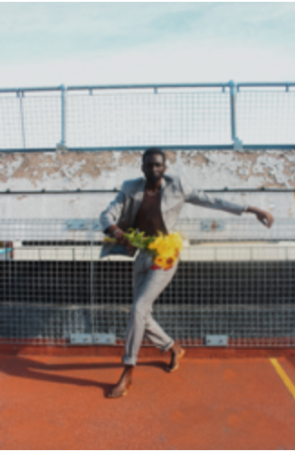
Image 7 TNT 21 Mariam Sholaja From the series UP , 2019 © Mariam Sholaja Courtesy of the artist