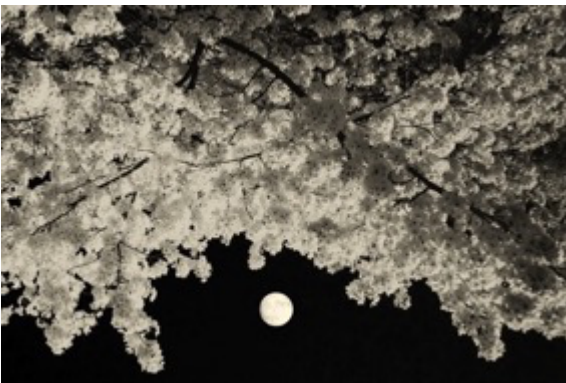
Image 15 Paul Cupido Moon Addict II , 2021