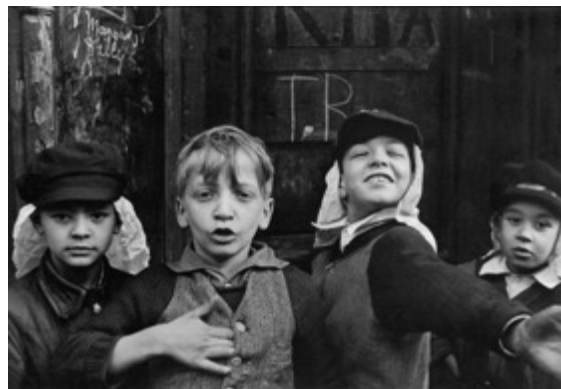
Image 2 Helen Levitt New York, 1940