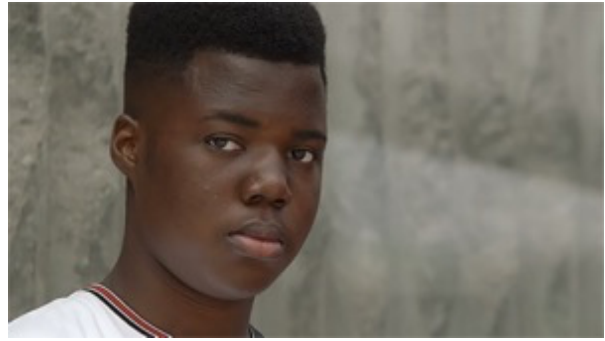
Image 6 Helen Cammock Still from Concrete Feathers and Porcelain Tacks , 2021 © Helen Cammock Courtesy of the artist