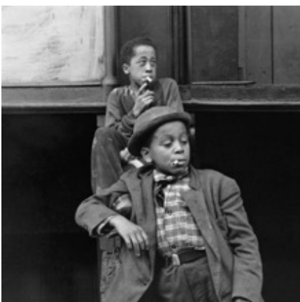
Image 3 Helen Levitt New York, 1940