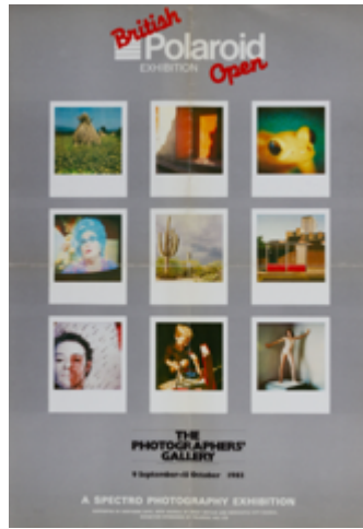
Image 14 Light Years: The Photographers' Gallery at 50 Exhibition Poster The Art of Polaroid: The British Polaroid Open Exhibition , held at The Photographers' Gallery, 1983