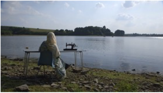
Image 5 Helen Cammock Still from Concrete Feathers and Porcelain Tacks , 2021 © Helen Cammock Courtesy of the artist