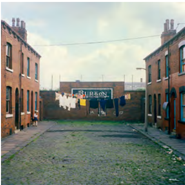
Peter Mitchell, Westlock Grove, Leeds, 1970s . From the series Early Sunday Morning

Alt text: Colour photograph of the corner of a shopfront. An individual can be seen in front of the building looking through the windows.