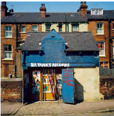
Peter Mitchell, Sir Yank's Records (& Heavy Disco), Gathorne Street, Leeds, Summer, 1976 . From the series Nothing Lasts Forever

Alt text: Colour photograph of a partially destroyed high rise building. Two cranes can be seen on either side of this building.