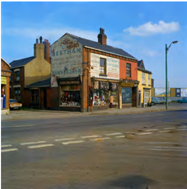
Peter Mitchell, Beetham's Cash Stores, Church Street, Hunslet, Leeds, 1970s . From the series Early Sunday Morning © Peter Mitchell

Alt text: Colour photograph of a row of derelict houses. In front there is a pile of bricks and rubble strewn across and the grass has been dug up.