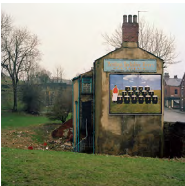
Peter Mitchell, Burley Road, Leeds, 1970s . From the series Early Sunday Morning

Alt text: Colour photograph of a residential road with clothes lines hanging between the two sides of the street. A young girl is stood on the doorstep of one of the houses.