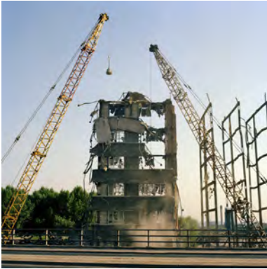
Peter Mitchell, Moynihan House, Quarry Hill Flats, 1978

Alt text: Colour photograph of a partially destroyed high rise building. Two cranes can be seen on either side of this building.