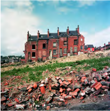
Peter Mitchell, Five Houses, Howden Place, Hyde Park, Leeds, 1970s . From the series Early Sunday Morning

Alt text: Colour photograph of a row of derelict houses. In front there is a pile of bricks and rubble strewn across and the grass has been dug up.