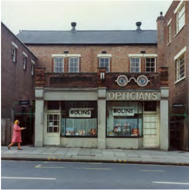
Peter Mitchell, Opticians, London, 1975 . From the series A New Refutation of the Viking 4 Space Mission

Alt text: Colour photograph of a shop front named 'Opticians'. A woman can be seen in the corner walking along the street.